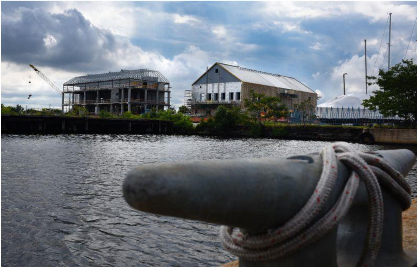
Port Covington area of Baltimore.