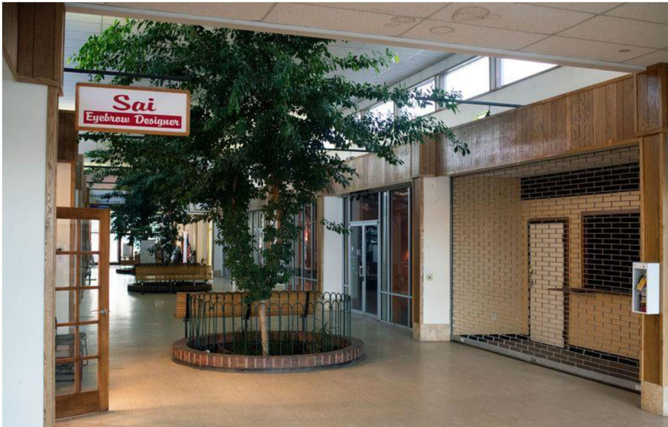
An eyebrow salon is surrounded by empty stores at Diagonal Plaza in Boulder.